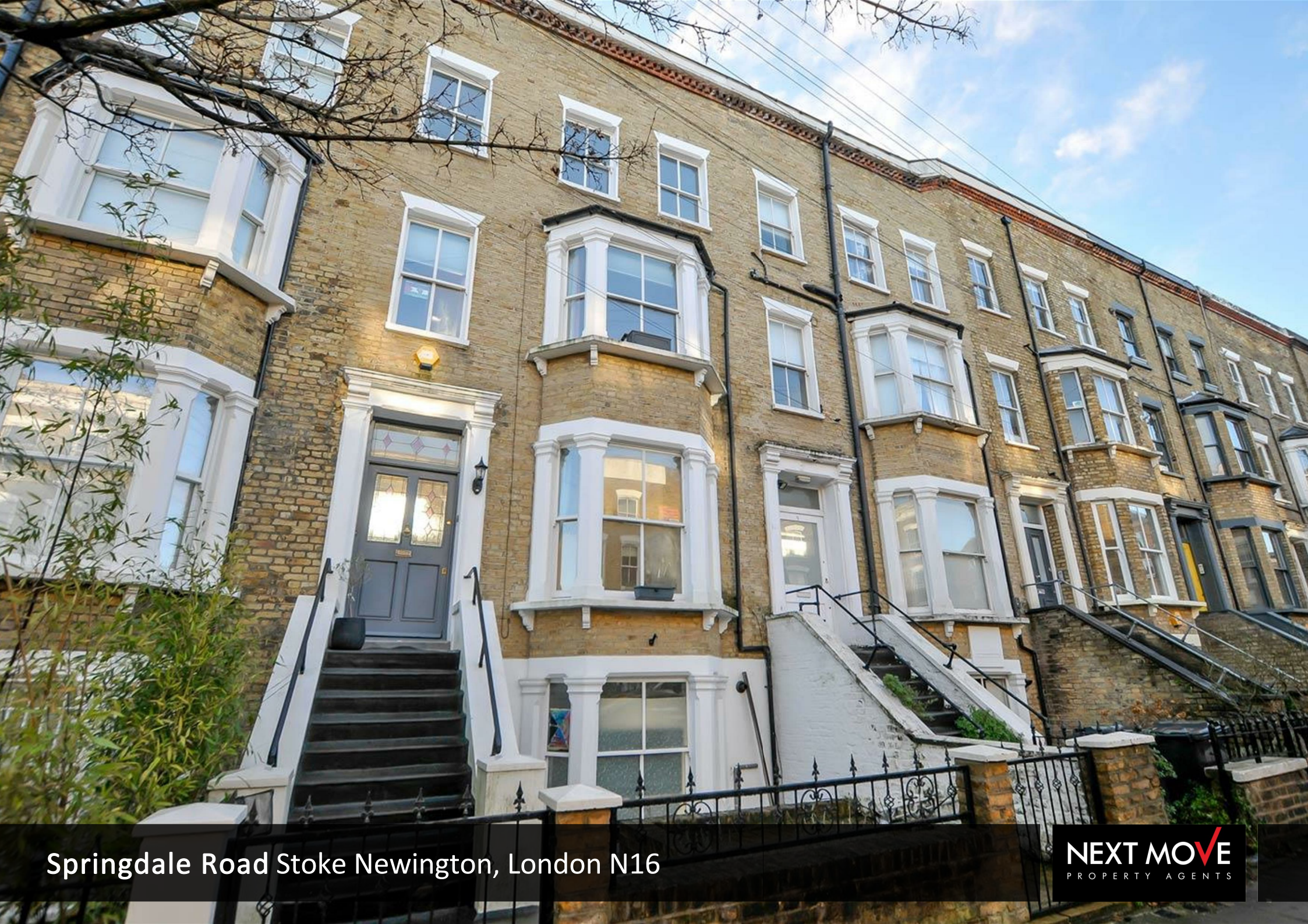
Springdale Road Stoke Newington, London N16